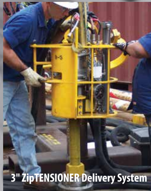
3" ZipTENSIONER Delivery System