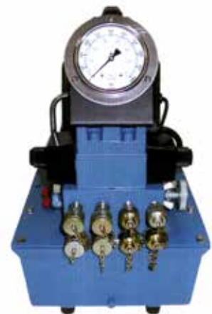
Electric Model 215E