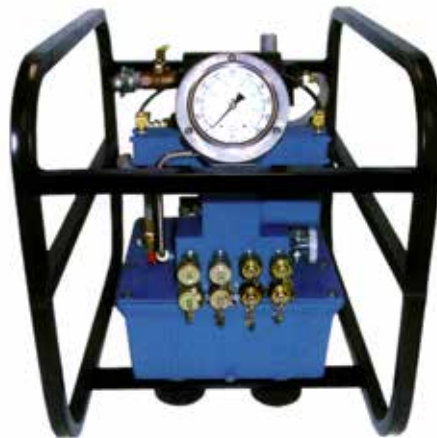
Air Model 205A

Standard equipment includes filter, regulator, lubricator, fittings and safety locks on quick disconnects, pressure gauge, remote controlled hoses and hydraulic hoses.